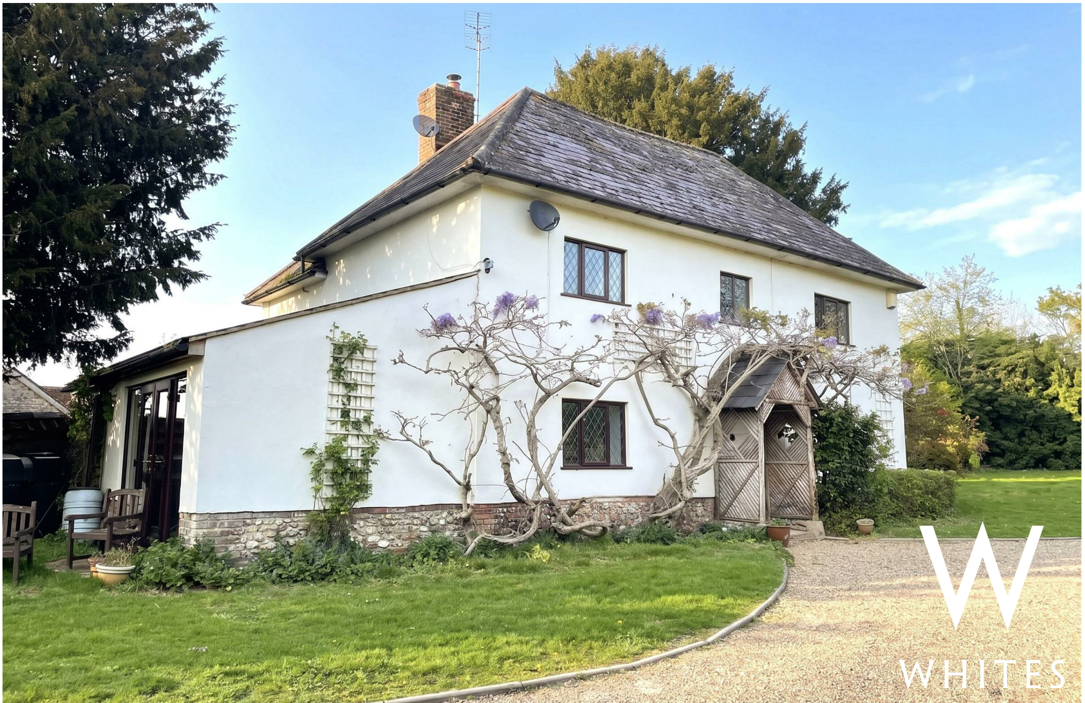
Primrose Cottage, Netton, Salisbury, Wiltshire, SP4 6AW